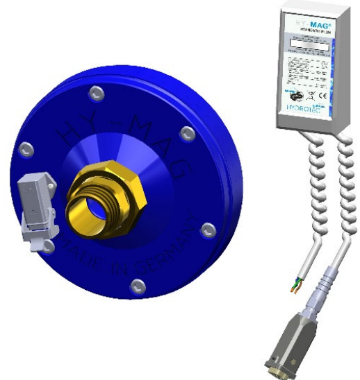
HY-MAG shown with Standard Plus Control Box

The HY-MAG can be supplied with several control options (see overleaf)