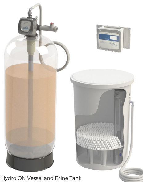
HydroION Vessel and Brine Tank

277 - 80 = 197\text{ppm} (hardness to be removed) 197 \times 0.46 = 90.62 sodium exchanged for 197 calcium and magnesium (0.46 ex. rate) 90.62 + 42.4 = 133.02\text{mgNa/l}