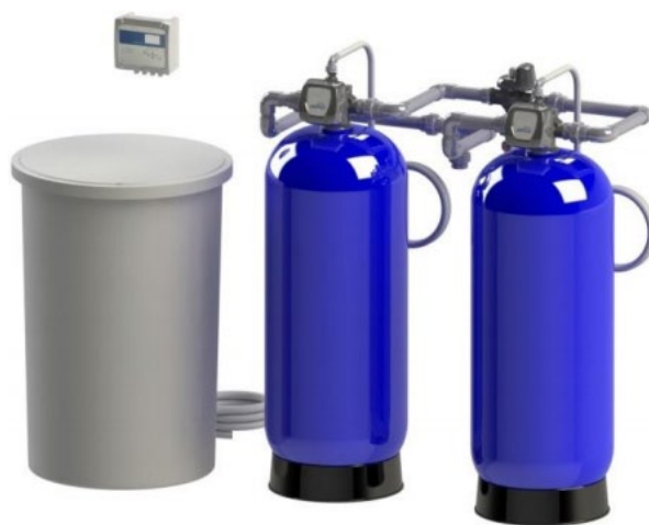
HydroION VAD CS Duplex Water Softener

The softener may also be supplied with an inline or bypass valve to achieve specific water hardness'