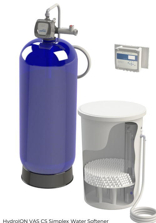
HydroION VAS CS Simplex Water Softener

“recharging/regenerating. During this multi-stage process the hardness minerals are washed away and a prepared brine solution is flushed through the resin bed replacing the lost sodium ions, the excess brine is flushed away and the softener is put back in to service with a full production capacity.