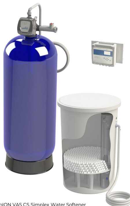
HydroIION VAS CS Simplex Water Softener

The softener may also be supplied with an inline or bypass valve to achieve specific water hardness'